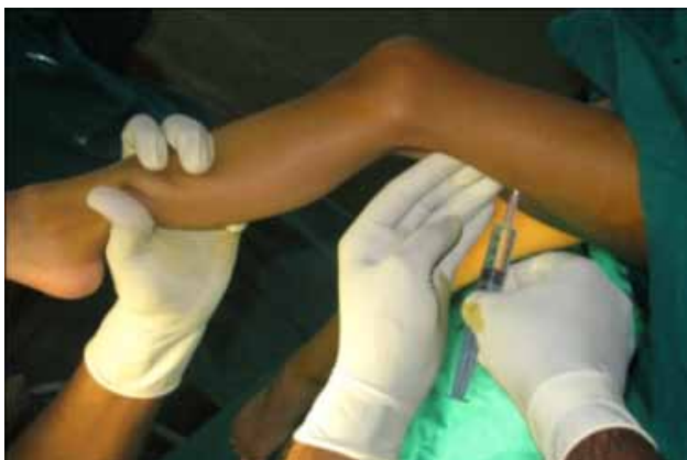
Fig. 2b. The biceps femoris is palpated and injected.