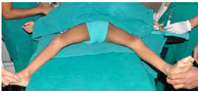
Fig. 1. Passive abduction of the hips demonstrated while the child is anesthetized to ensure that there is no contracture of the adductor muscles before proceeding with the myoneural block.

The myoneural block with alcohol is done in the operating room with the child under anesthesia. The child is examined under anesthesia again to confirm that there is no contracture by demonstrating a full range of passive motion (Fig. 1).