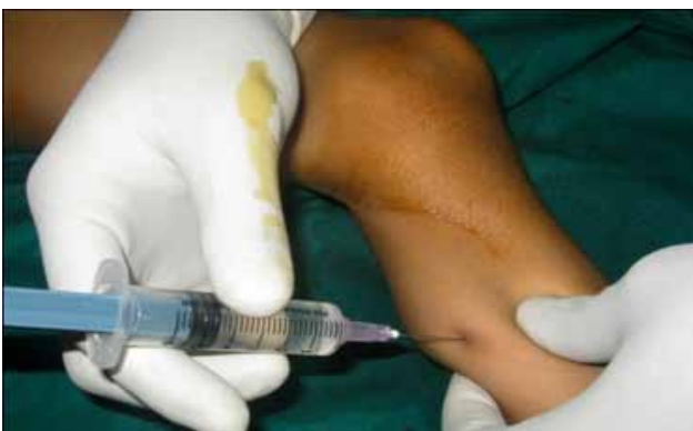
Fig. 2c. The bellies of the medial and lateral heads of the gastrocnemius are palpated and injected.